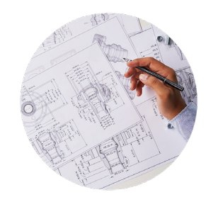
Design & Engineering services