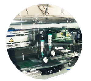
Manufacturing SMT and THT assembly